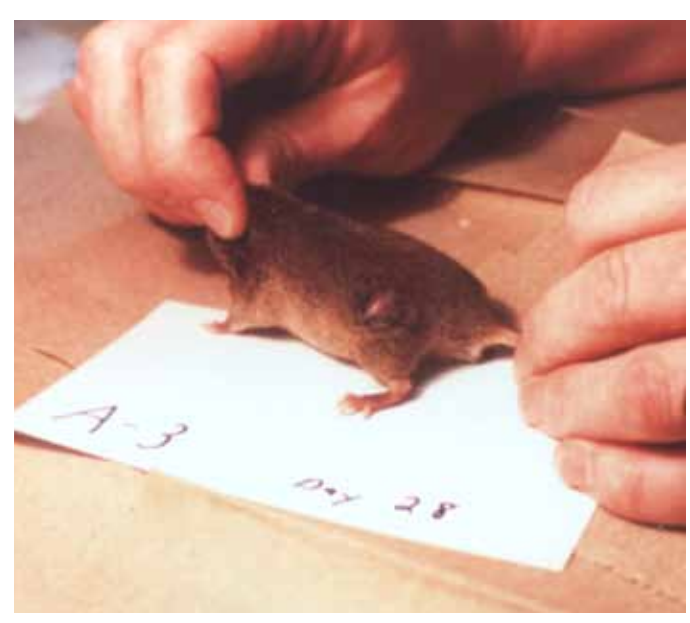
Day 28: Tumor ulceration begins.

But after the conference, I began to look into placebos a bit more, and what I found astonished me. The idea that a placebo could produce real physiological effects was unthinkable in medicine 50 years ago, but by now medicine recognizes that placebos do work, even as the mechanism by which they work and the circumstances under which they work remain a mystery. Yet, in fact, it turns out that placebo effects increase over time to the point where up to 80 percent of the effects of drugs can be mirrored in placebos. The strength of this