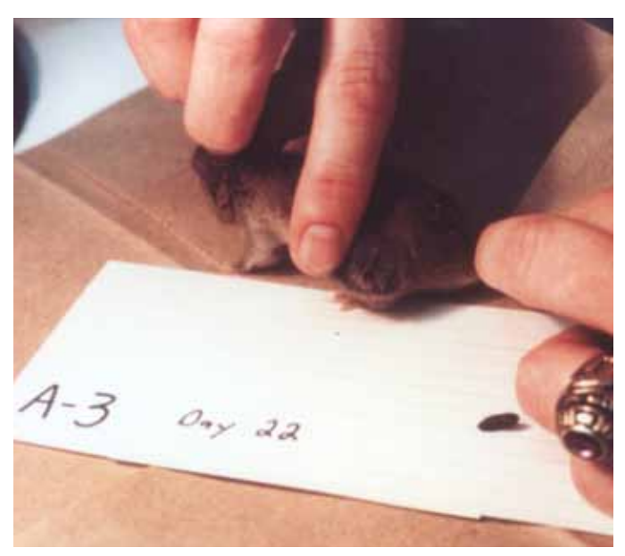
Day 22: A blackened area begins to develop on the tumor.

The four skeptical "volunteers" then replicated what I did, and we got essentially the same results. All of the mice were cured. I then moved the operation to St. Joseph's College where I was working, and with the chair of the biology department there did experiments three and four with other skeptical volunteers. In those experiments we also tried injecting the mice with twice the dosage necessary to produce a fatal cancer, tried multiple injections, and even tried re-injecting them after the experiment was over. But the mice remained immune to future injections throughout their two-year lifespan.