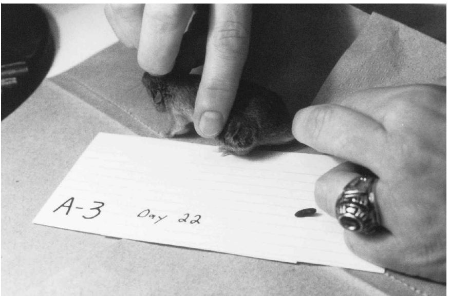
Fig. 2. Twenty-two days after injection.

mors (Figures 1 and 2). At this point, Bengston presumed that the experiment was failing and wanted to call it off. Krinsley convinced him to continue, reasoning that there was nothing to lose. Approximately 1 week later, the blackened areas "ulcerated" as if they had been split open (Figures 3 and 4). In some